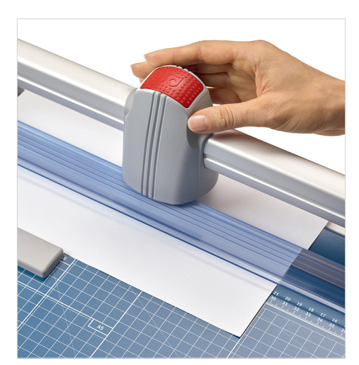
Automatic clamp applies gentle pressure to prevent your work from shifting.