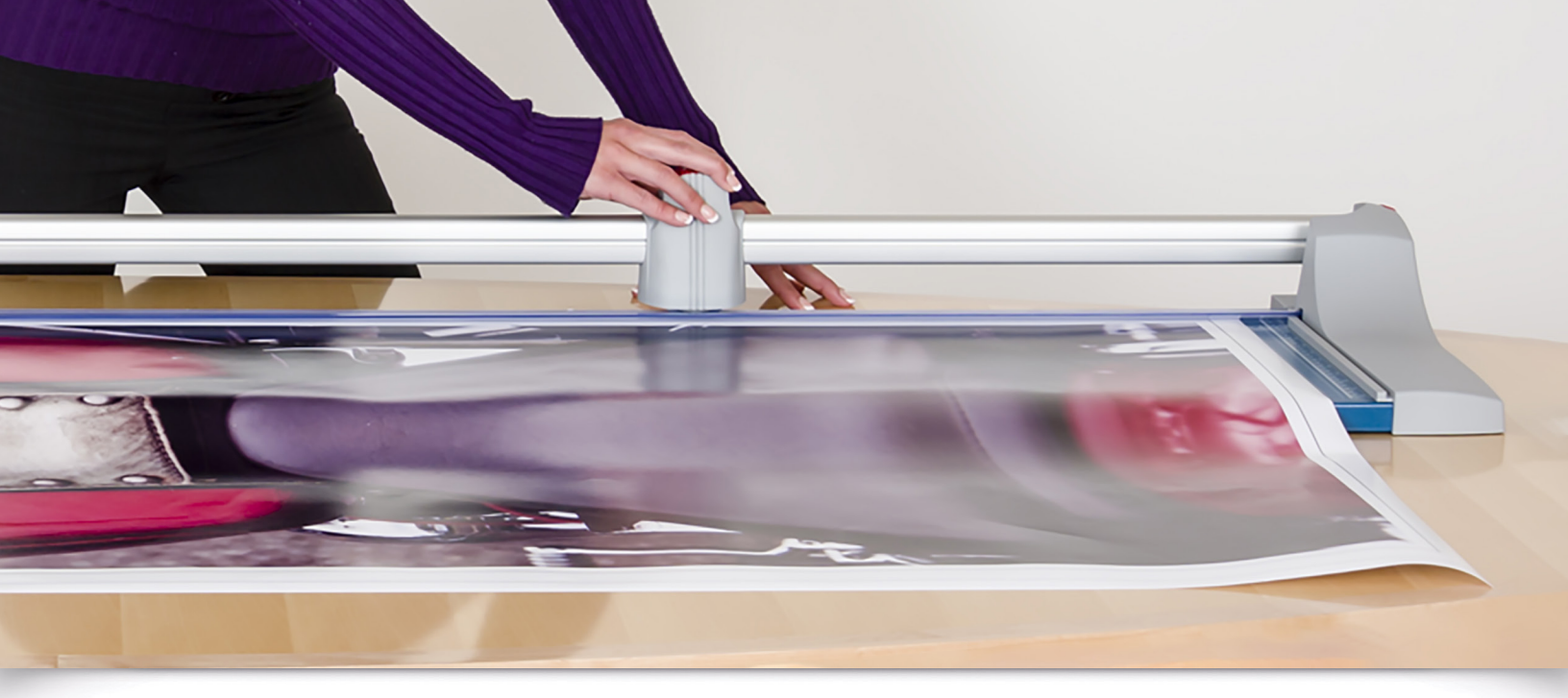
With a self-sharpening blade and a sturdy metal base, this precision cutter is ideal for trimming paper, photos, cardstock, and matboard.