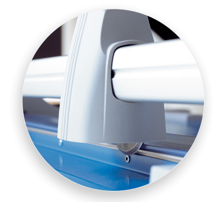
Self-sharpening system maintains a perfectly honed blade.