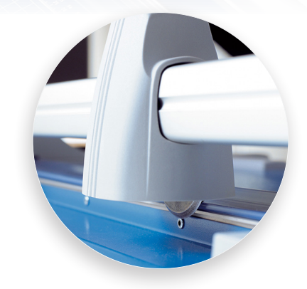
Self-sharpening system maintains a perfectly honed blade.