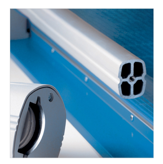
Dual cylinder aluminum guide bar keeps cutting head straight and stable while trimming.