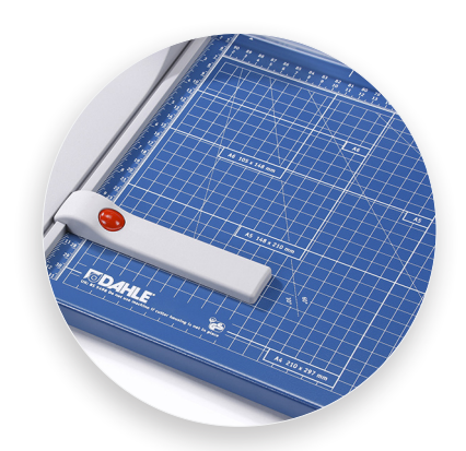
Easily align work with screened inch, metric, and angled guide lines.