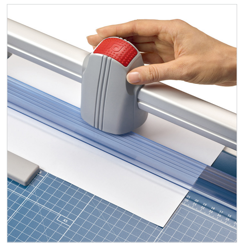
Automatic clamp applies gentle pressure to prevent your work from shifting.