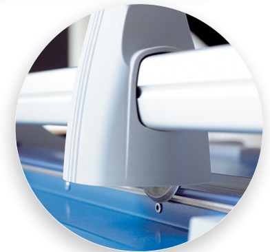
Self-sharpening system maintains a perfectly honed blade.