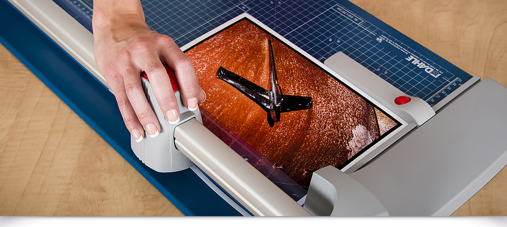
With a self-sharpening blade and a sturdy metal base, this precision cutter is ideal for trimming paper, photos, cardstock, and matboard.