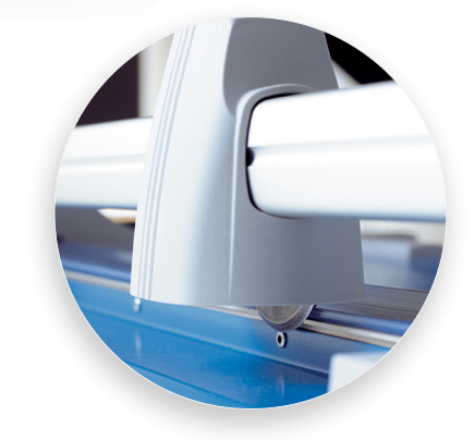
Self-sharpening system maintains a perfectly honed blade.