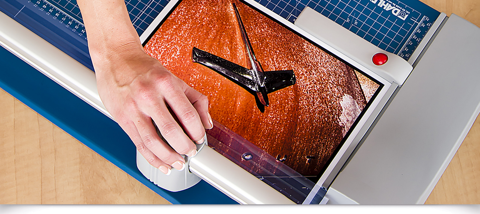
With a self-sharpening blade and a sturdy metal base, this precision cutter is ideal for trimming paper, photos, cardstock, and matboard.