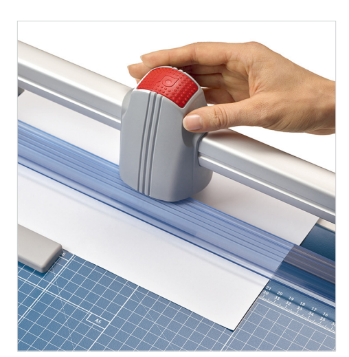
Automatic clamp applies gentle pressure to prevent your work from shifting.