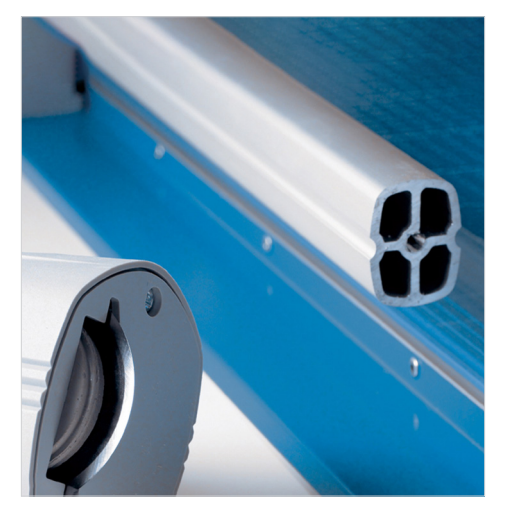
Dual cylinder aluminum guide bar keeps cutting head straight and stable while trimming.